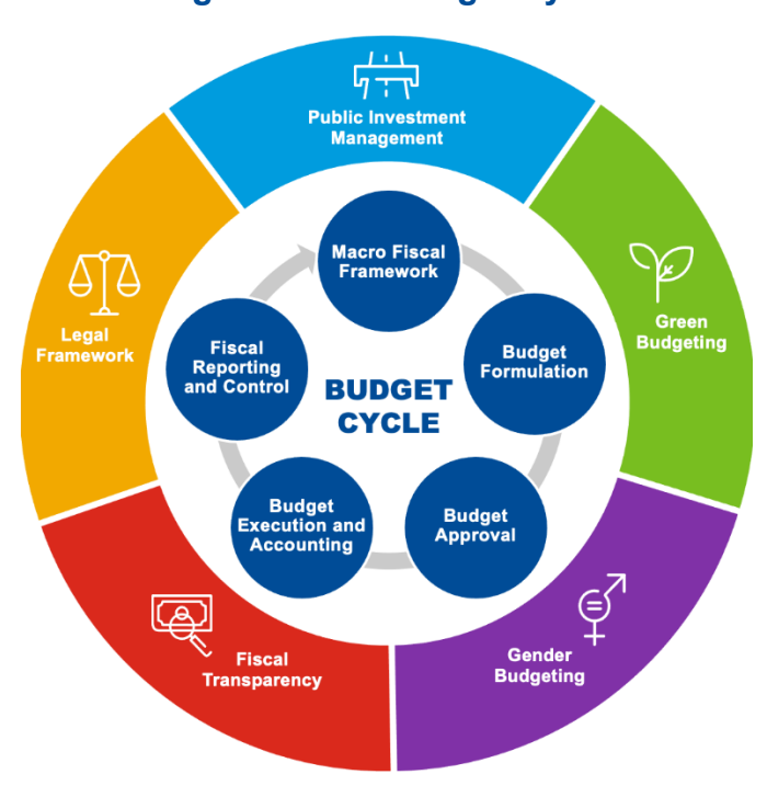
Figure 3. The Budget Cycle

This module will help countries to develop a more effective, efficient, and transparent budget process enabling them to better manage their public finances. It will include fiscal policies, rules and analysis, strategic planning and medium-term fiscal frameworks, medium-term budgets, budget formulation and allocation, budget execution and accountability, fiscal risk management and analysis, fiscal reporting and control, fiscal transparency, PIM, and gender budgeting and climate budgeting. Figure 3 is an illustration of the budget cycle and the topics covered by this module.