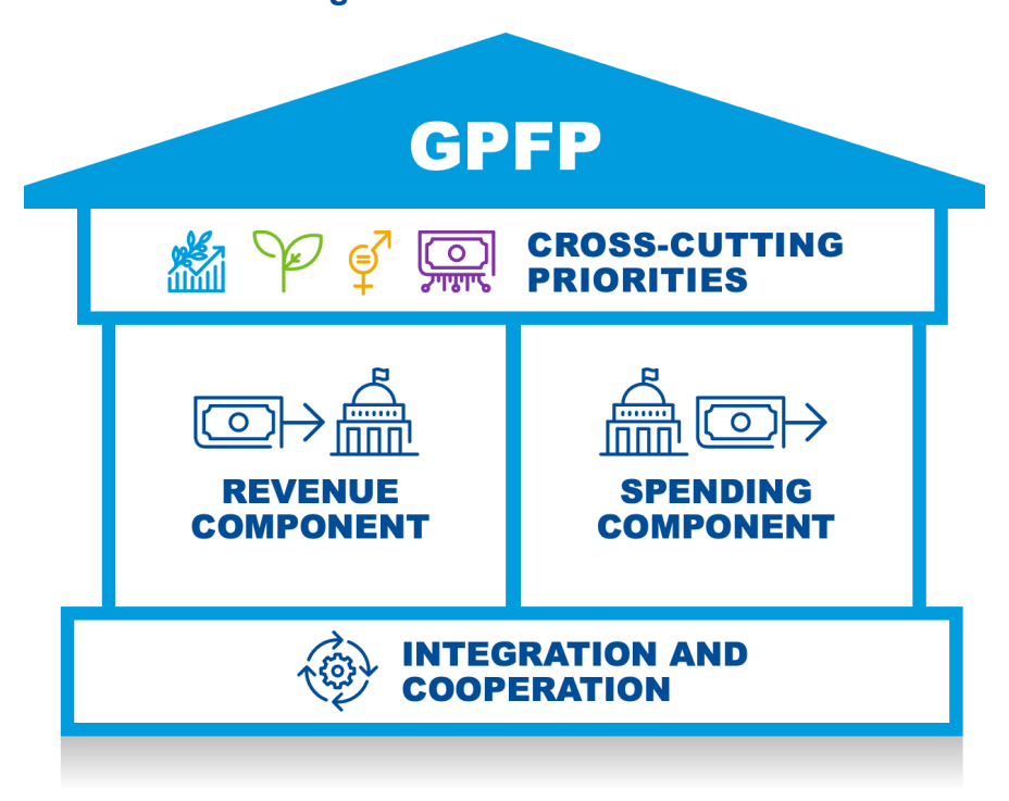
Figure 1. GPFP Structure